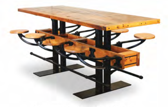
Reclaimed Pine Pub Table