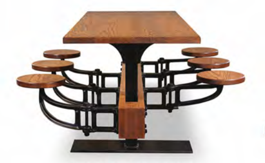
Red Oak Six-Seater

Custom built from a variety of materials to your specifications