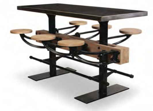
Stainless Steel Pub Table