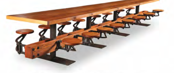
Communal Table (Any Length)