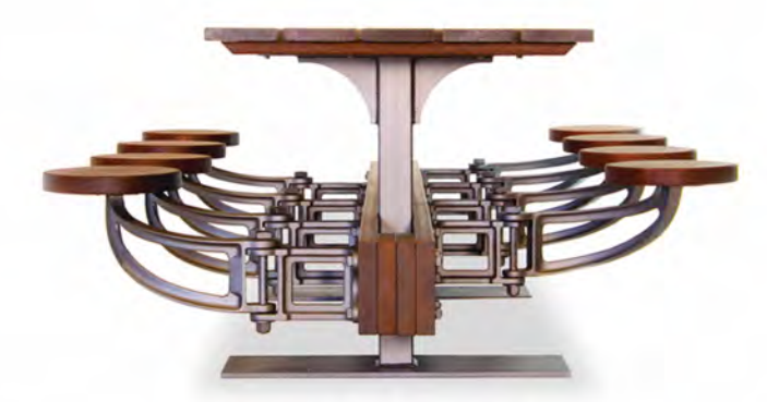
Outdoor Brazilian Walnut