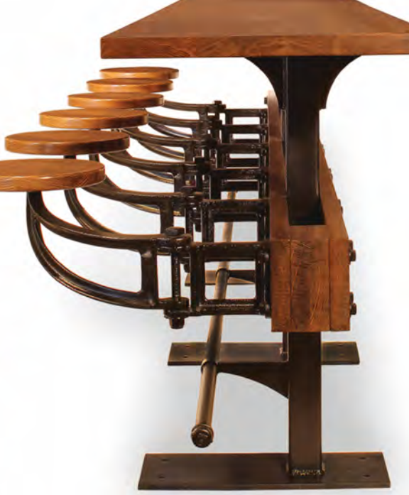
Single-Sided Counter with Red Oak